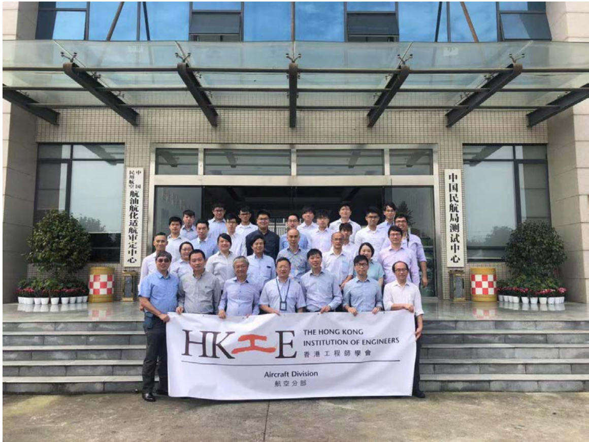
Technical Visit to Chengdu (24 - 28 Aug 2019)