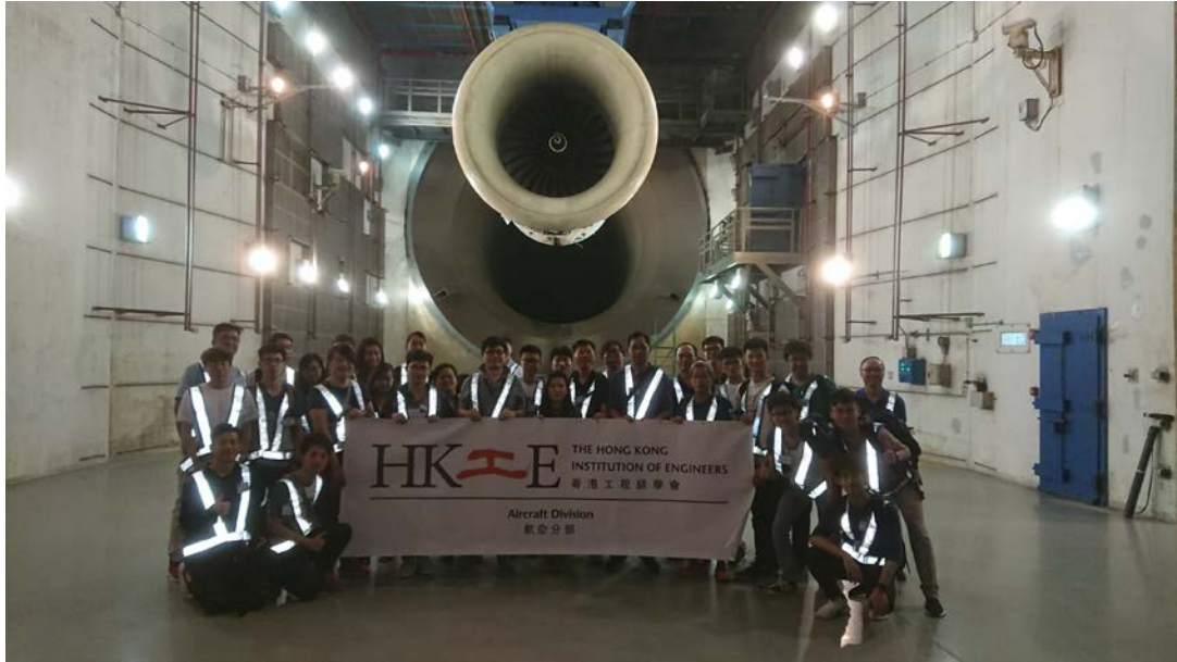
Technical Visit to HAESL (25 May 2019)