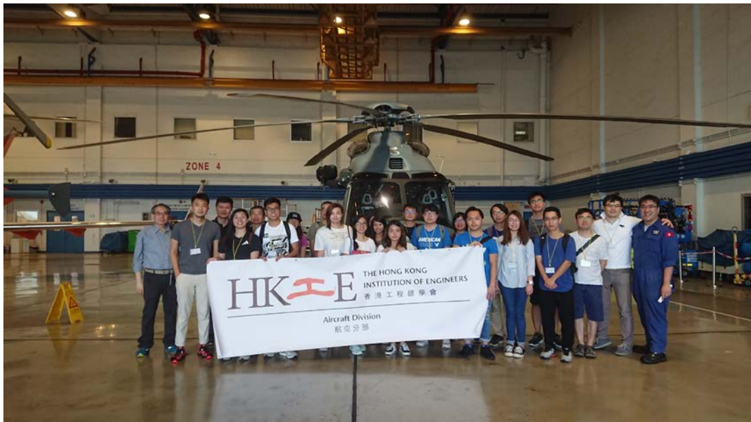
Technical Visit to Government Flying Service (17 Aug 2019)