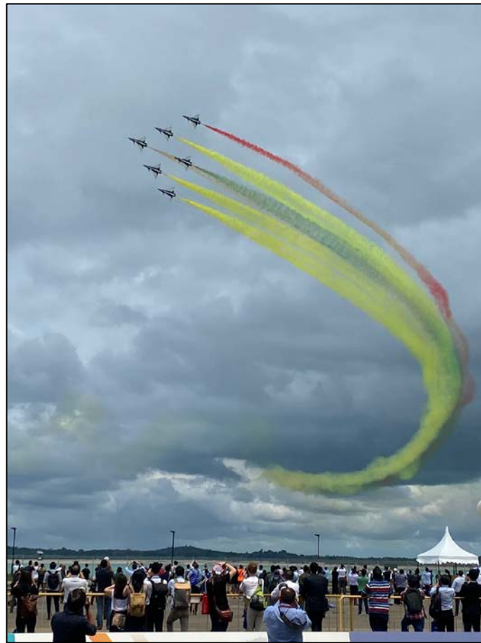
Technical visit to Singapore (10 -13 Feb 2020)

Moreover, we organised two overseas technical visits to Chengdu and Singapore Airshow on 24 - 28 August 2019 and 10 -13 February 2020 respectively. The technical visit to Chengdu covered four aviation related organisations including drone development and application.